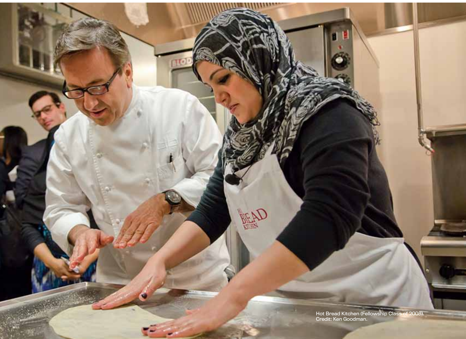
Hot Bread Kitchen (Fellowship Class of 2008).